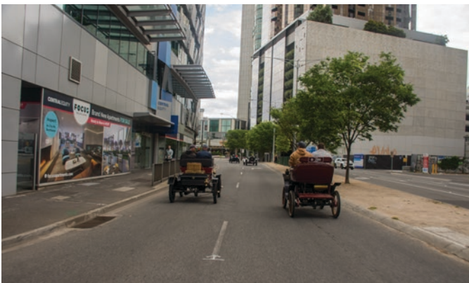
1904 Curved Dash Oldsmobile and the 1899 De Dion Bouton driving through Melbourne CBD together