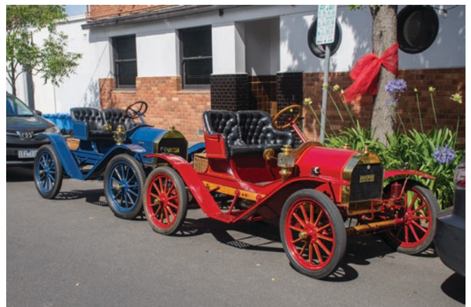
Two Brushes, one carpark