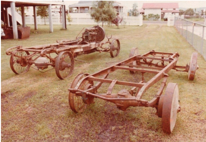
In this photo we see the Maudslay on the left and the chassis on the right is a c1908 Napier.