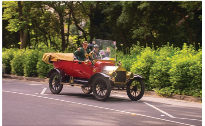
Darren Savory in the 1916 Ford Model T