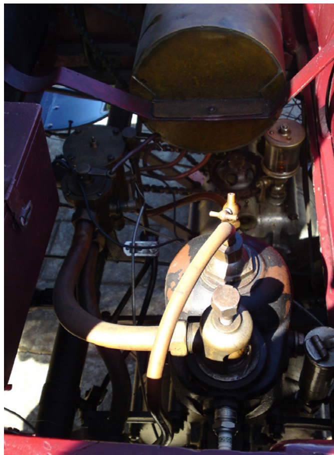
View of engine compartment

I am very privileged to own this motor car which I consider to be the forerunner of the modern motor car. Thank you De Dion Bouton. You led the way.