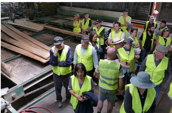
Entrants being shown through Powelltown Sawmill