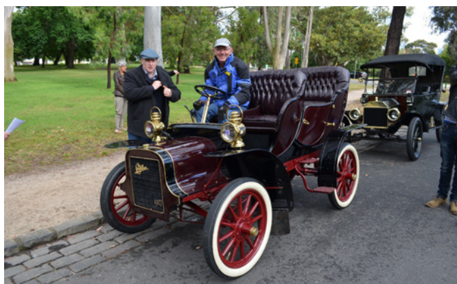
Provan's 1907 Cadillac