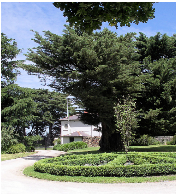
Looking across the drive of Coombe Cottage