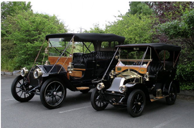
Cadillac and Renault models for 1910 at Yering Station