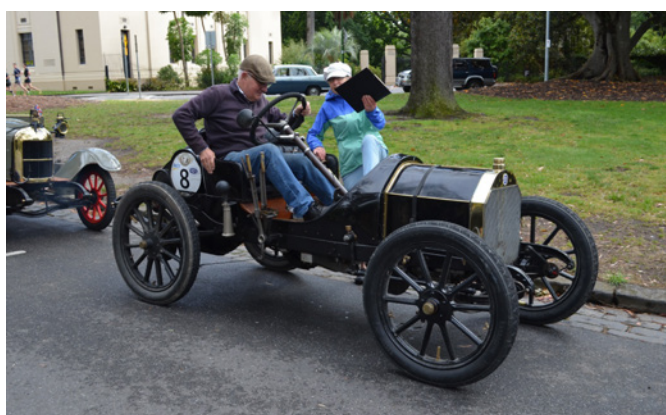
Latrielle's 1908 Isotta Fraschini