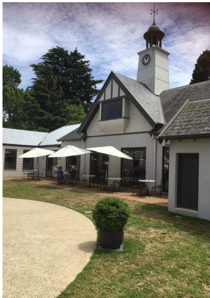
The motor house at Coombe Cottage

Of particular interest were the early vehicles that she owned, and she kept a "motor" on three continents. During performances in Paris in 1903 she bought her first vehicle, an electric Brougham at the Paris Automobile Show. The first report of Melba behind the wheel is in 1904 in Paris, when, on a trip from the Hotel Ritz to Versailles, her chauffeur reportedly knocked down and killed an elderly man.