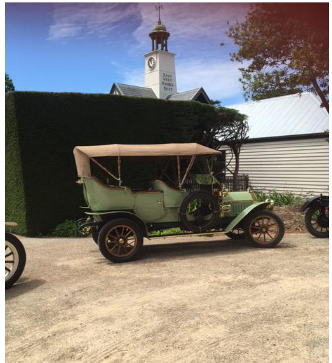
This 1910 FN tourer demonstrates the height of the Motorhouse tower in the background.

Her home when in Australia, was "Coombe Cottage" located at Coldstream, near Lilydale which has become a tourist attraction. It features a vast garden and sweeping views of the Dandenong Ranges and, the first in-ground swimming pool in Victoria. She was also an enthusiastic motorist, owning several, and may have been the first Victorian woman to hold a driving licence, according to the current Manager of Coombe Cottage. A feature of the property, was the purpose-built Motorhouse, with a clock tower and bell tower, with 4-car accommodation, now serving as a modern café (left).