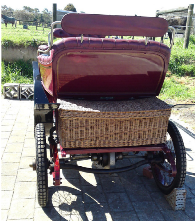
Rear view of the De Dion

No wonder, it is recorded, about 150 other car manufacturers, including the first Renault, installed De Dion engines in their cars. By the year 1900 it is estimated there were 40,000 De Dion engines in use throughout Europe. De Dion made the first V8 engine. A member in our sister Club in Adelaide has such a car which I have seen on Rallies. A straight 8 engine was made much later but probably did not take off because of the price.