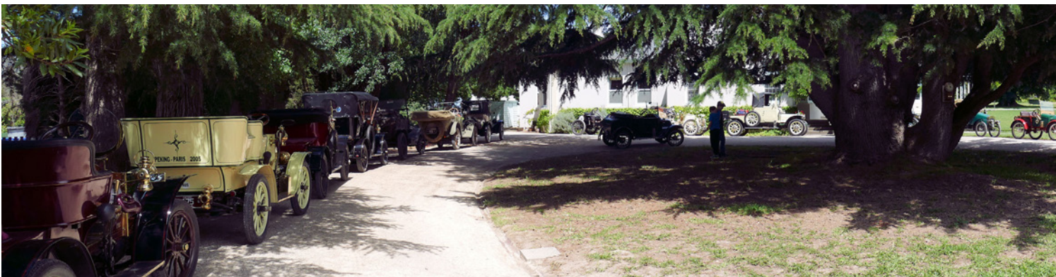
Panoramic shots of cars parked at Powelltown and Coombe Cottage

The RACV Healesville Country Club was the headquarters for this year's RACV Annual Rally (November 18th – 20th), an event which is a highlight of the Veteran Car Club of Australia (Vic) calendar. The Country Club was the perfect destination with wonderful accommodation rooms and recreational facilities. The weekend was so popular that we quickly filled our maximum allocation of 30 rooms and many members stayed at other local motels and B&Bs.