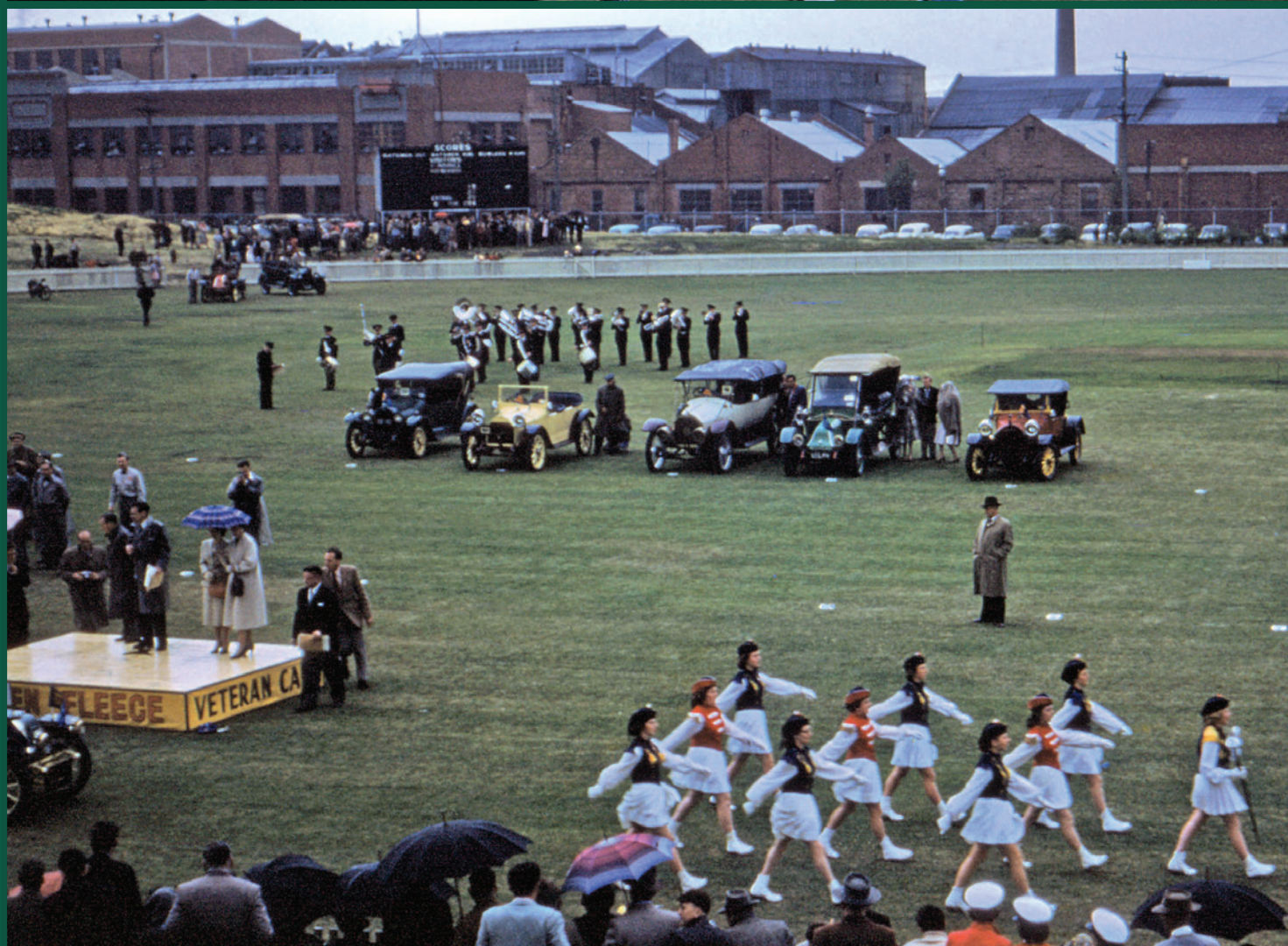
For this month's FLASHBACK to make it easier (!!) we have 2 photos from an early VCCA (Vic) event - and yes, there were marching girls and a brass band present. Where and when was this rally - and how many of the cars can be recognised?