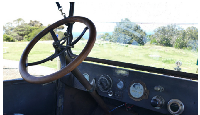
Cockpit of the Chev

So I’m now going back to Tasmania a lot sooner than I ever expected, to retrieve the Baby Grand and bring it home so I can replace the axles and bearings and do some of the little things that I had listed during the week’s touring and get her ready for the next major tour in South Australia next September. Not the ideal end to a long tour but I am still very pleased with the Baby Grand’s performance and the response it evoked both from the public and members and look forward to many, many more tours in it in the future.