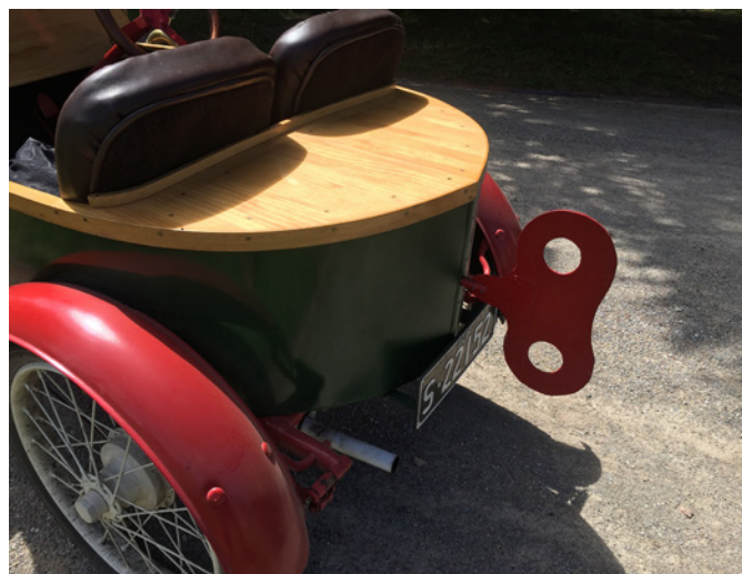
The car had to be wound up to it's full extent to get up the hills