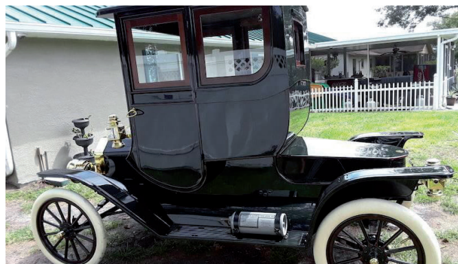
1909 Model T Ford Coupelet for auction at Mecum

The design of the new Model T began in 1907 and by early 1908 working models were being assembled.