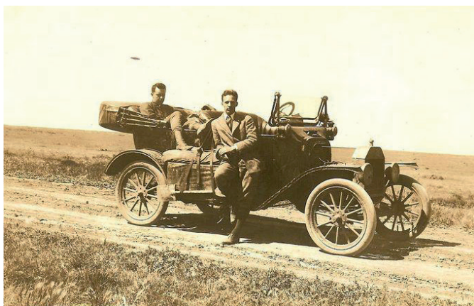
1915 – Edsel Ford with some pals on his cross USA trip

Q: Whose untimely death would you most like to reverse?