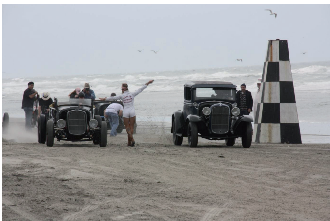
Engines roar as they churn up the sand!