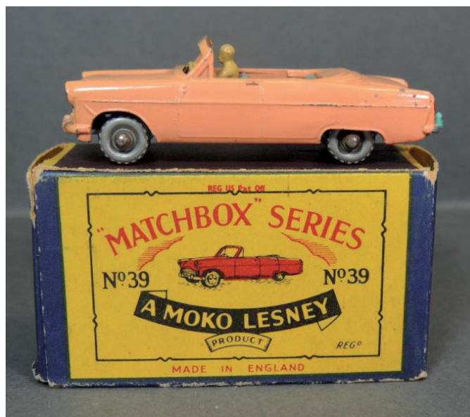
A 1953 Lesney Matchbox Ford Zodiac Convertible on Ebay for $32