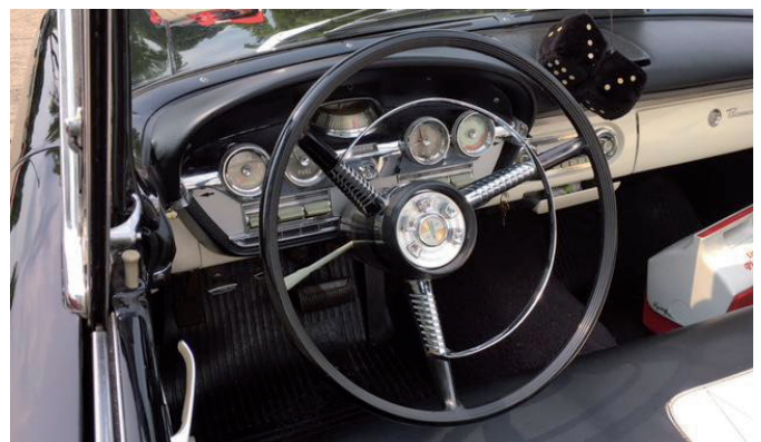
Futuristic gear selection 'push button'