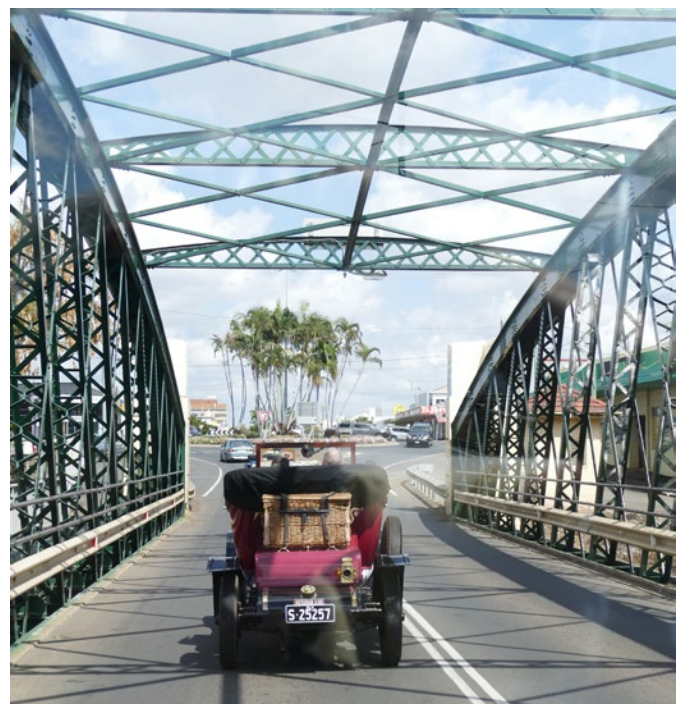
Crossing the Bridge at Bundaberg.