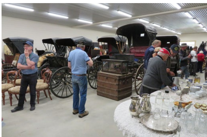
Private carriage collection.