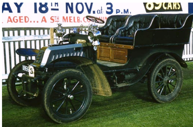
Photographed at Port Melbourne Cricket Ground at the conclusion of the 1956 Golden Fleece Rally. It had been one of a number of South Australia rallies on entrants on this the first of the Cub's November rallies. Refer Dementia Prodest.