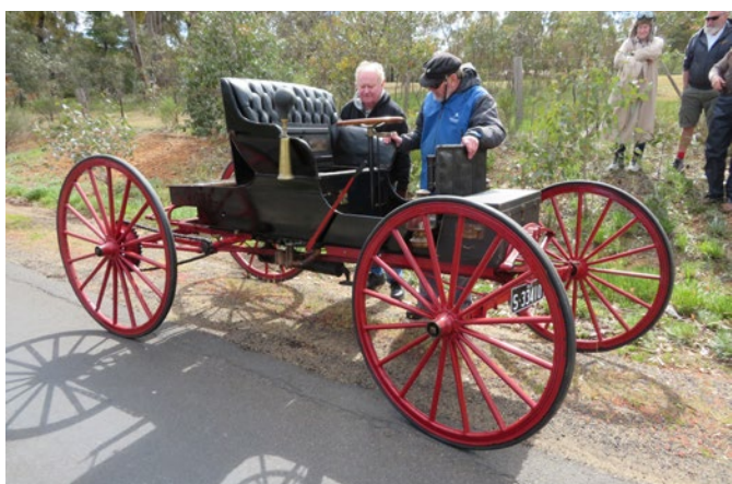
Trouble with the Economy.