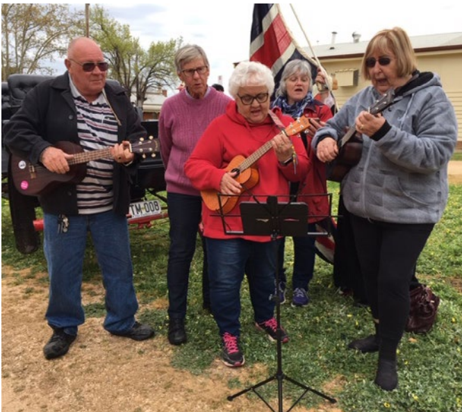
Chitty Chitty Bang Bang... they sang in harmony (well sort of).

The ‘village glee club’ of ukuleles sang a rousing rendition of ‘Bang Bang Chitty Chitty’, and with great regal flourish ‘Queen Victoria’ welcomed us all to Dunolly. ‘Off with their heads – off to the Tower’ she cried. It didn’t matter that her namesake had departed this earth in 1901 – a number of years prior to the advent of the high wheeler. She was a real hoot – loud and gregarious – she delighted in getting me in her clutches. Rule Britannia!