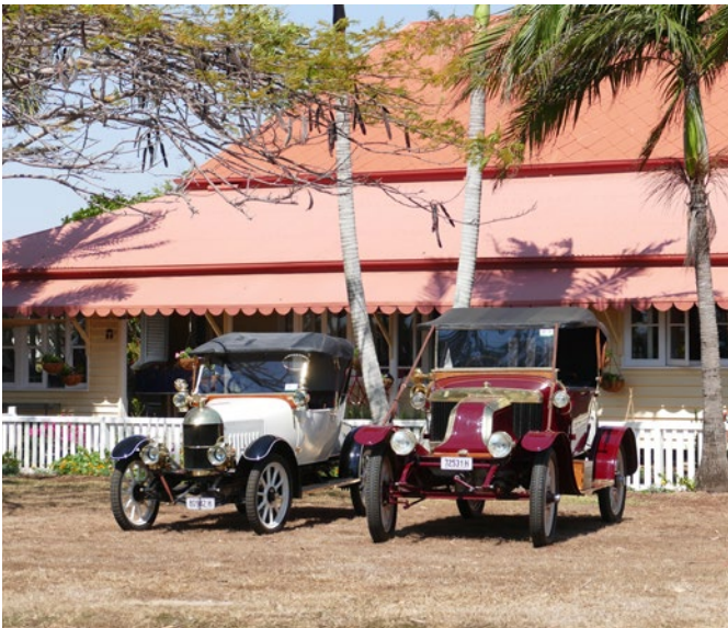
When I grow up, I want to be a Phoenix – Ashburns' 1913 Phoenix next to the Prodger's 1915 Morris Oxford.

That evening crowds had gathered For the big gas light parade The locals sure were keen to see Our cars and clothes displayed