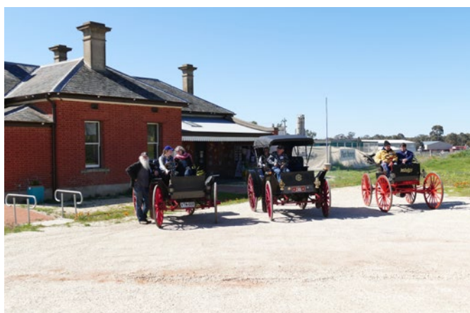
At the Avoca Railway Station.