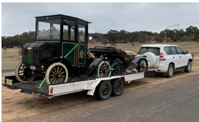
1910 Brush D24 'Top Hat' together with 1910 Brush D26.