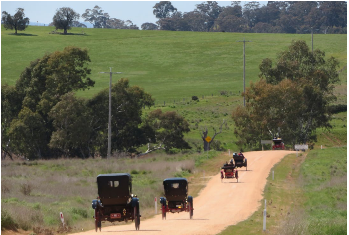
On a suitable road for veterans.

Monday morning was the start of a great week of highwheeler motoring supported by generally excellent weather. We all gathered with our vehicles at the nearby Ron Sinclair Reserve for our briefing prior to a shorter shakedown run. The opportunity was taken to get a photo of the highwheelers lined up whilst we had a full complement. Today's run took us to nearby historic Talbot where we enjoyed a sumptuous morning tea before returning to Maryborough and having lunch by Lake Victoria. The ducks were very interested in any dropped crumbs. We then assembled in front of the historic Railway Station (Mark Twain once described it as a railway station with a town attached) for a photo shoot with the aid of a cherry picker for elevation. The photo shoot was memorable for the excellent setting with the buggies and also for the aggressive station