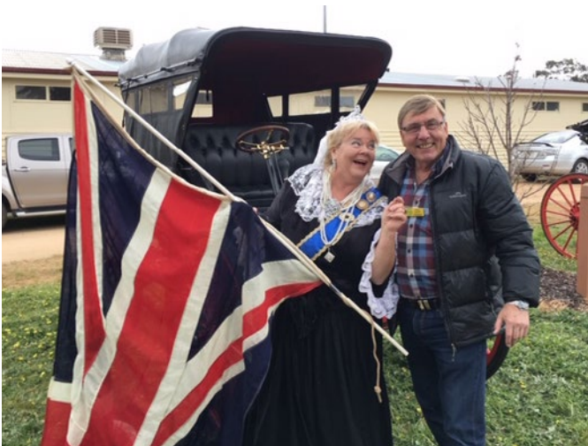
The Queen was all eyes... for President Paul.