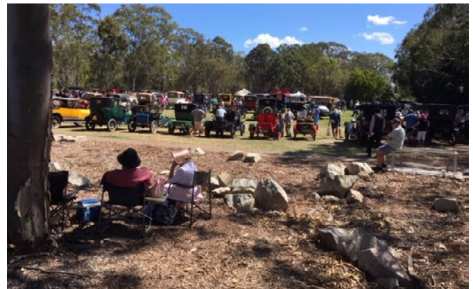
Sunday morning display, Bundaberg.