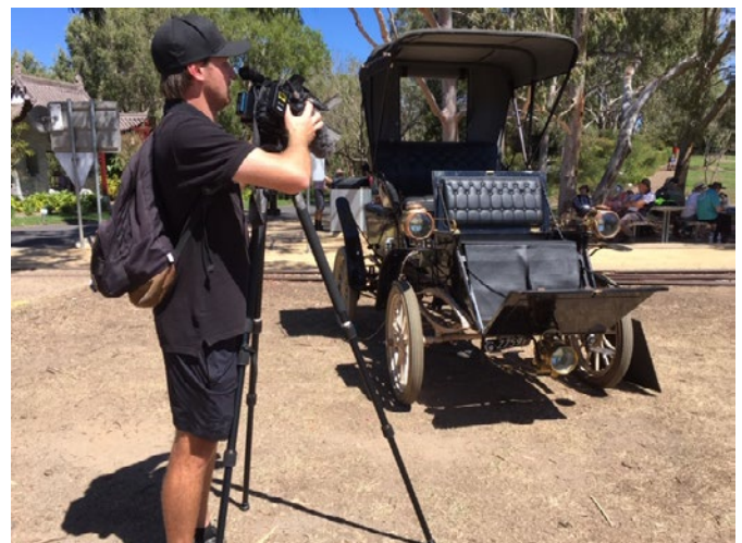
Bundaberg... plenty to photograph!