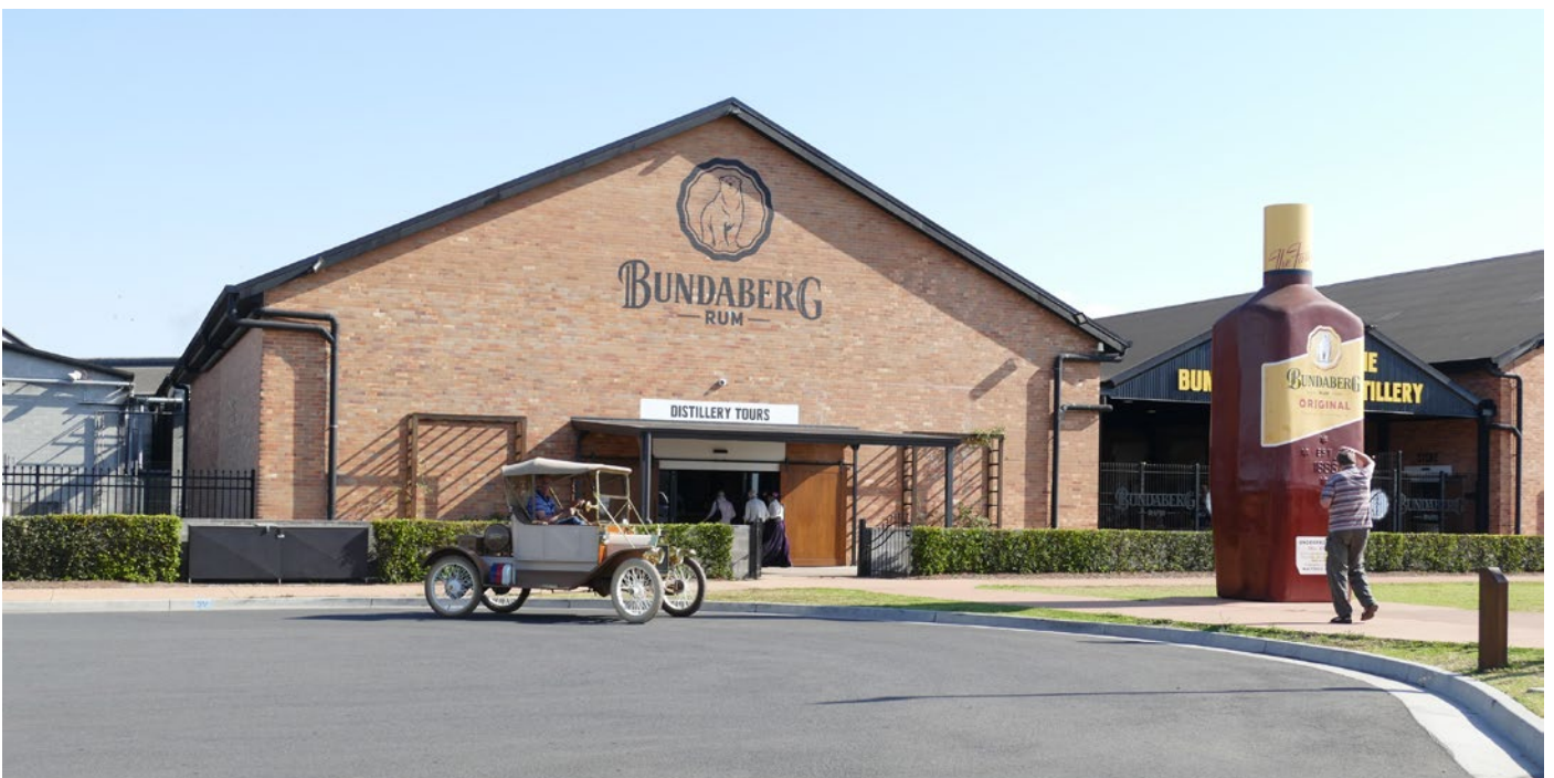
The Bundaberg Rum distillery.