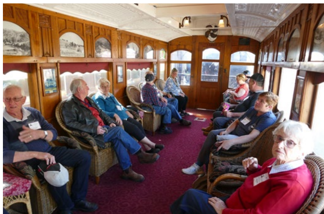
On the train Maldon to Castlemaine.