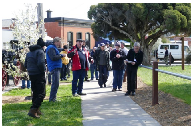
Morning Tea in Talbot.