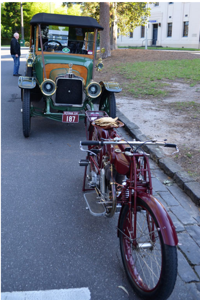
Greg Orde's Rover Motorcycle