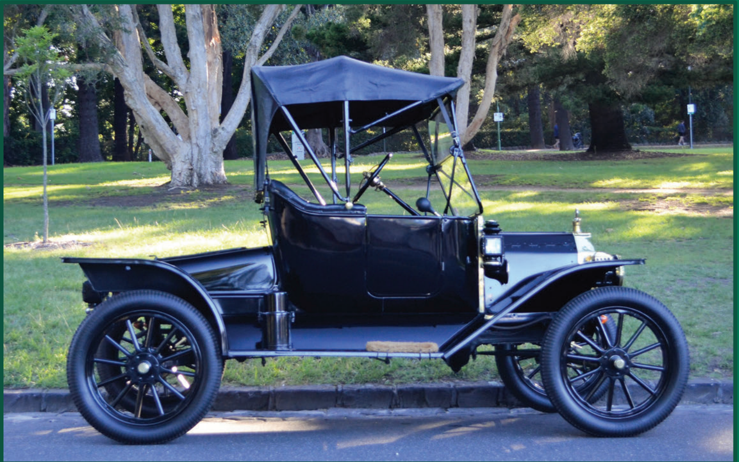
Scott Staples' 1914 Ford T on the 2 wheel brake rally