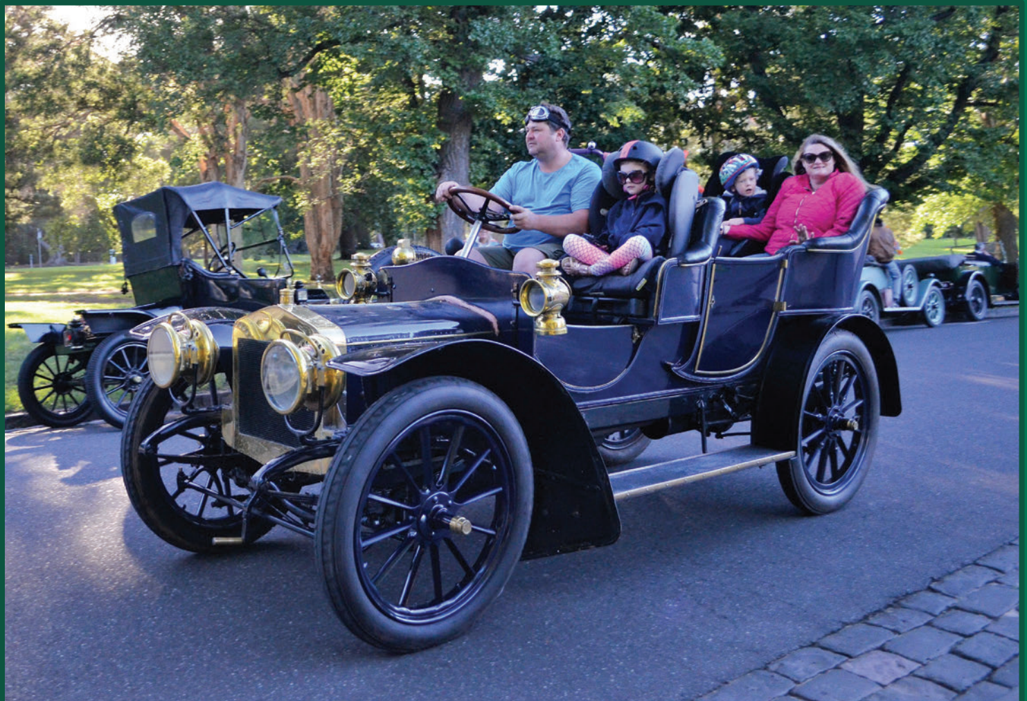
The Auditori family in the Vulcan on the 2 wheel brake rally