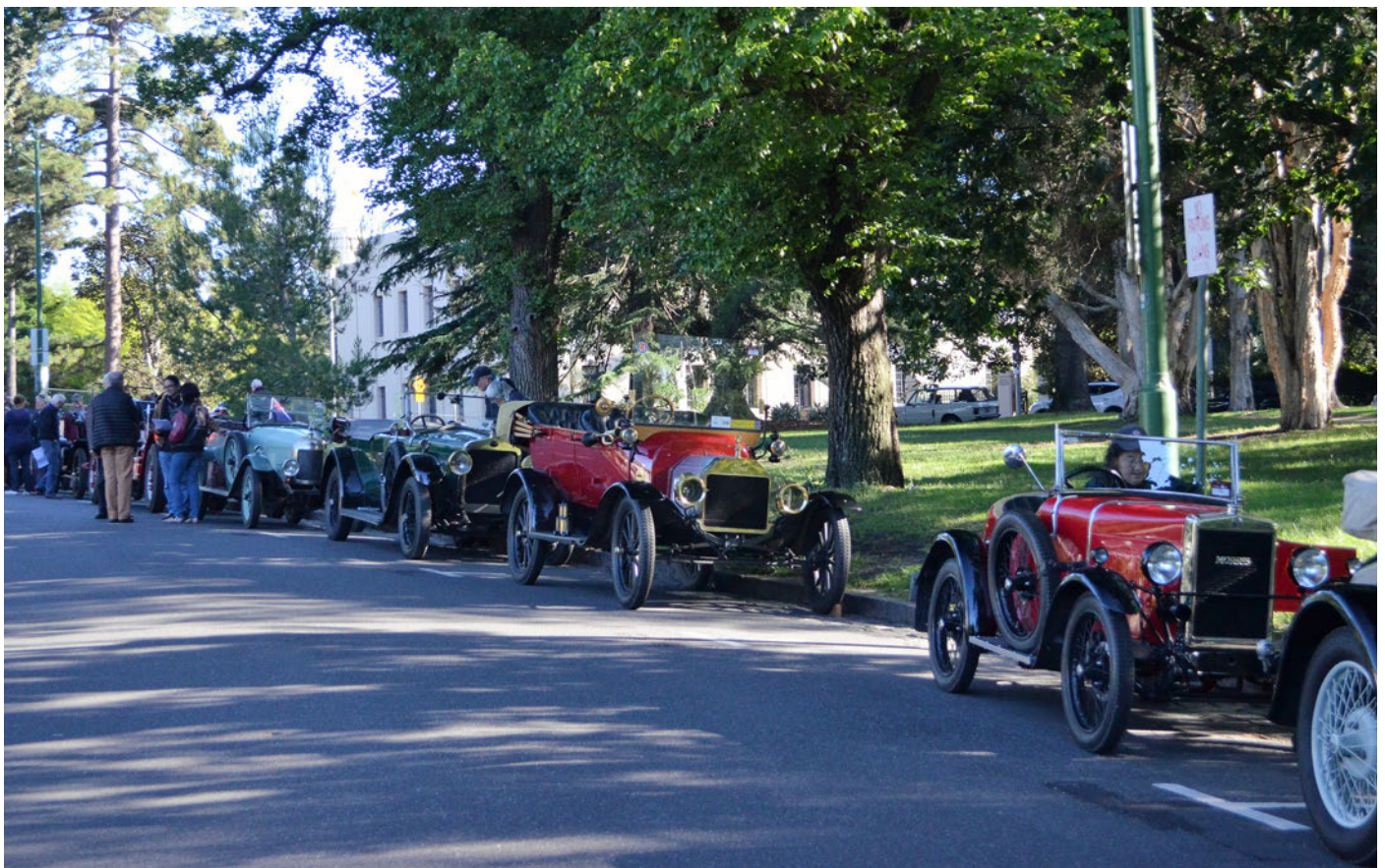
Cars outside the Herbarium

Ian and Alastair Berg - 1921 Rolls Royce Silver Ghost