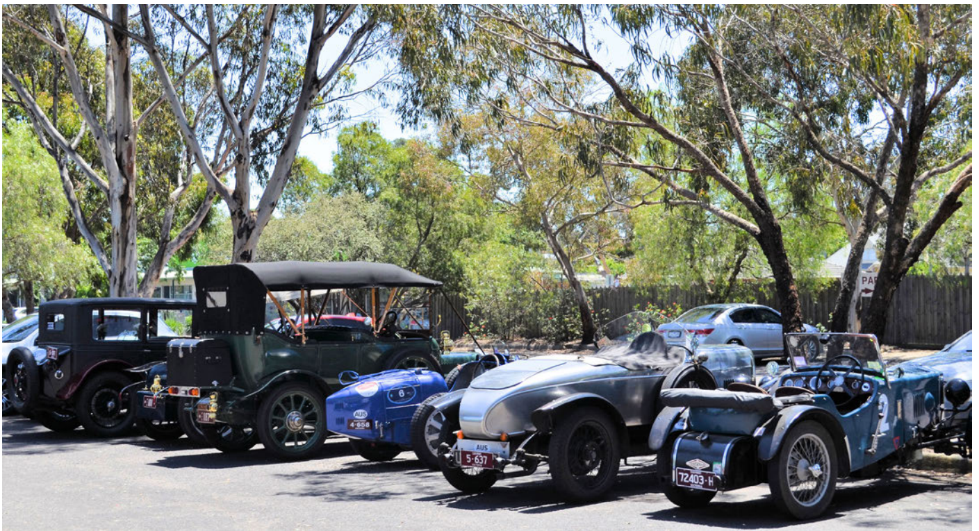
A variety of rear-ends on display on the 2 Wheel Brake Rally