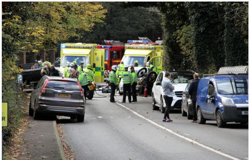
The fatal crash happened at about 11.35am