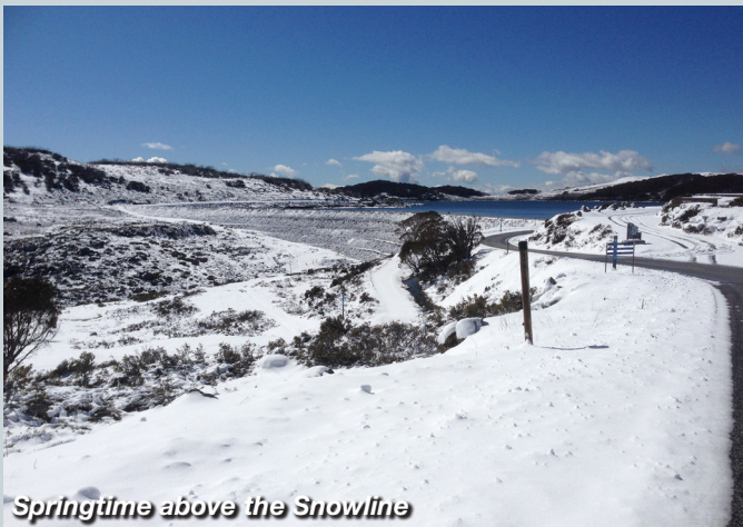
Springtime above the Snowline