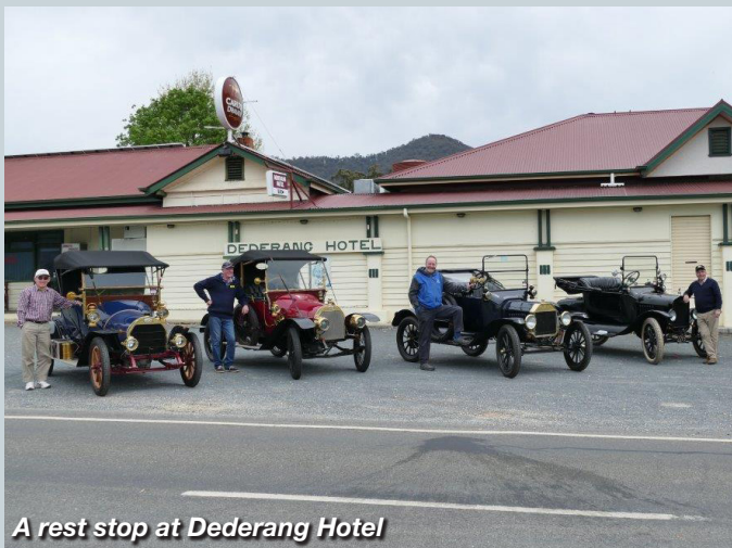
A rest stop at Dederang Hotel

Stoewer Museum - John's collection of Stoewer cars is located between the Mountain Creek Motel and Mt Beauty. Coming from Dederang it is on the left 100 m before the Bright turnoff. The house is by itself, surrounded by farm land. Visitors are welcome.