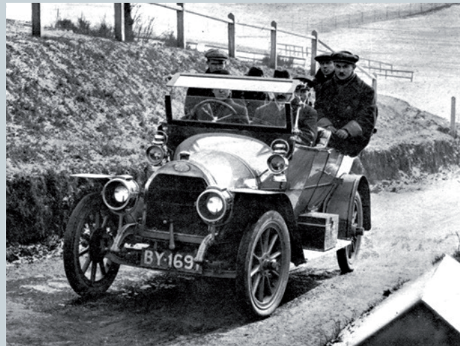
Here is proof

The 4-wheeled occupants of the Stower Museum in Tawonga South issue you with a challenge. If the smallest occupant, a 1911, 16 HP Model B1 of just 1,566cc engine capacity can carry 8 passengers up Test Hill at Brooklands with a gradient of 1 in 4 in 1912, then can you carry your Master's from Mt Beauty to Falls Creek, a climb of 1,200 m in 30 km, at a mere average grade of 3.9%?